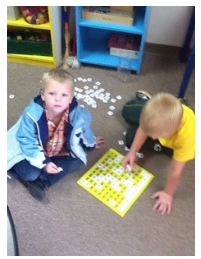
Matching numbered tiles to the corresponding places.