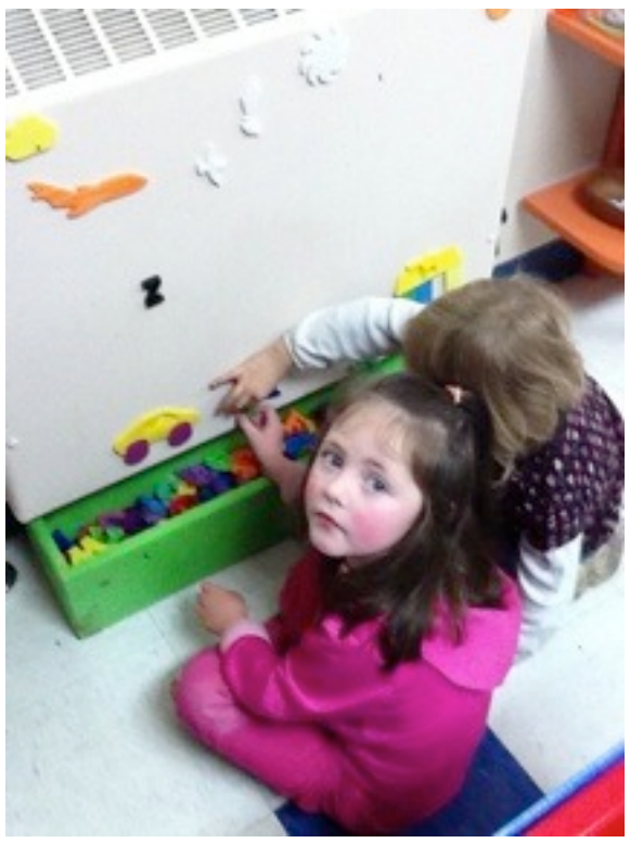
Playing at the ABC magnet board.